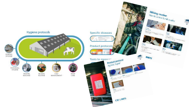
Distributorzone & trainingcenter